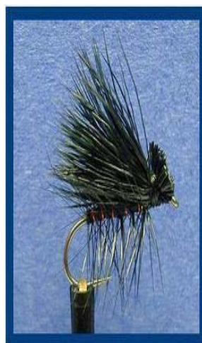
Black Deer Hair Caddis

Hook : Mustad 94840, or Standard Dry Fly hook, Size 12 - 16. Thread : Black 6/0. Body : Black dubbing. Rib : Hot Orange tying thread. Hackle : Whiting 100's Saddle Hackle Black Palmered over the body. Wing : Black Deer (shown) or Elk body hair. Head : Trimmed ends of the hair used for the wing.